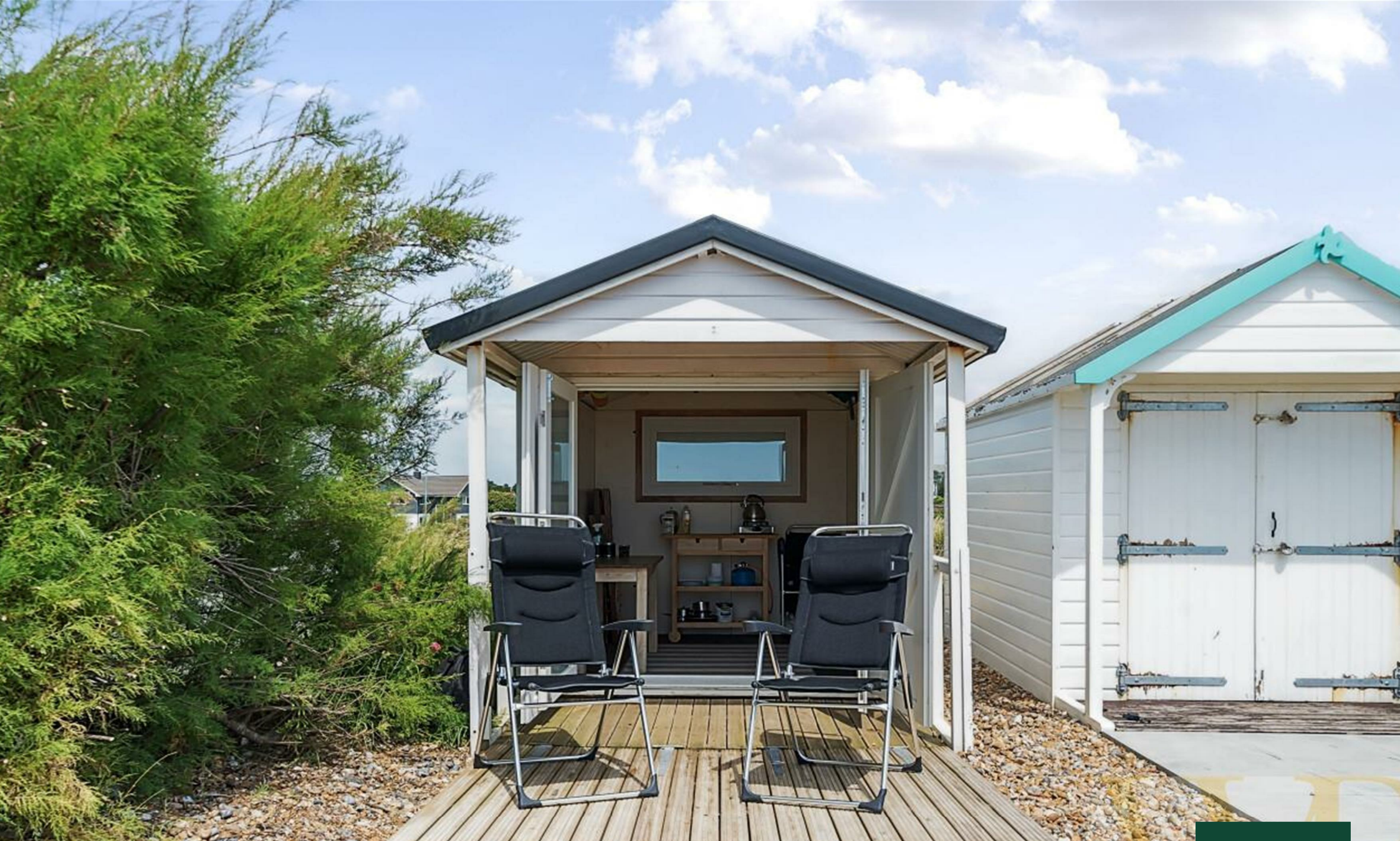
Beach Hut 26 Beach Green | | Shoreham-By-Sea | BN43 5YE